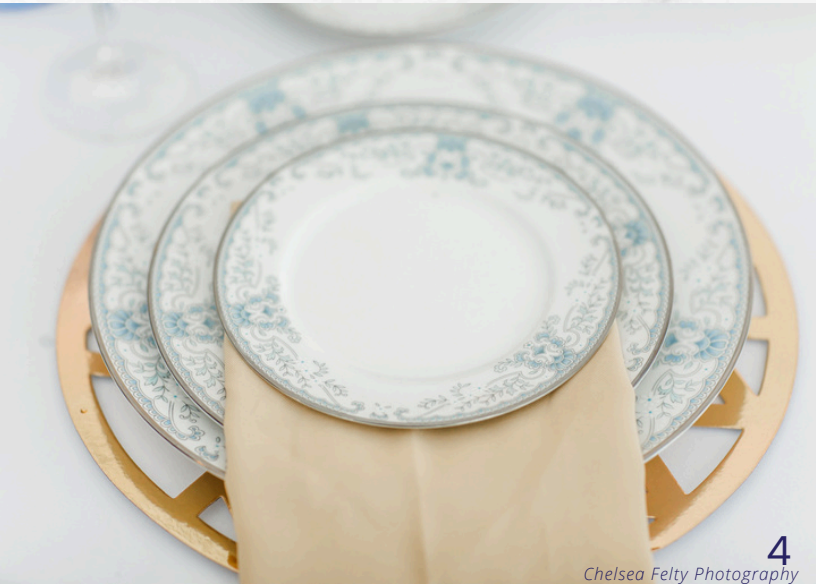
4 Chelsea Felty Photography