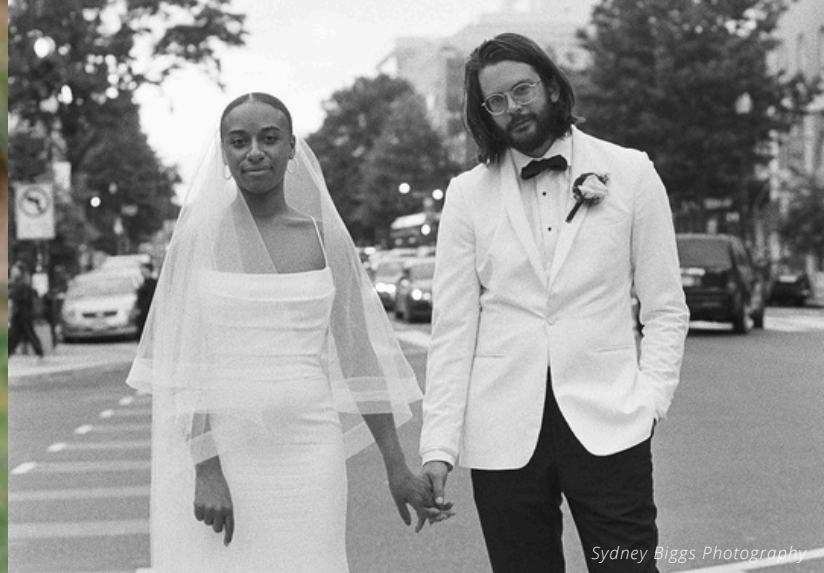
Sydney Biggs Photography